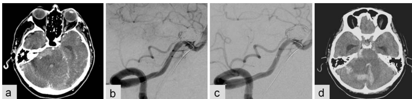
Fig. 2 Fatal intracranial haemorrhage into a preexisting ischaemic area. The patient was treated with a balloon-assisted coiling of a wide-necked Pica aneurysm 5 days after SAH. During intervention, thrombus formation is noted in the proximal Pica adjacent to the aneurysm (b). In addition to mechanical disruption attempts, the thrombus formation is treated locally during intervention with 3 mg of abciximab through the microcatheter resulting in thrombus resolution

In our study, 36.5% of the thromboembolic complications occurred during the treatment of wide-necked aneurysms, whereas the majority (63.5%) were encountered during the embolisation of aneurysms with a neck diameter \leq 4 mm. Hence, neck size does not appear to be the sole determining factor of thrombus formation. Other factors contributing to thrombosis may include manipulation within the aneurysm and blood flow alteration by catheters or balloons. The propensity of additional devices (e.g. stent, balloon) to induce thromboembolic complications is still under debate. Although some previous studies reported a higher incidence of thromboembolic complications [4, 19] if these were used, we did not find a significant difference. These results are in